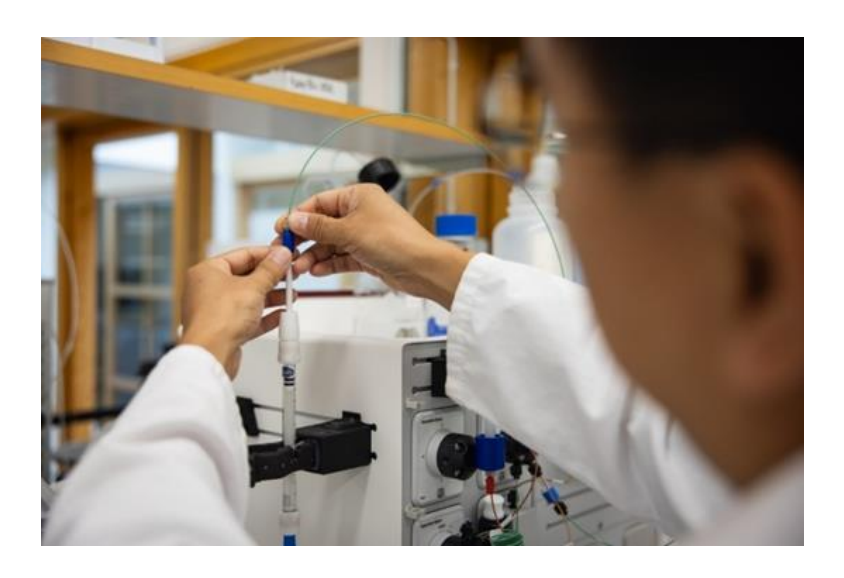
Bio-Works | Interim report Jan-Mar 2025

The war in the Ukraine together with geo-political tension, also in other parts of the world, has increased the level of uncertainty. Increased uncertainty has a negative impact on the world economy and global supply chains, both in the short term and in the longer term.